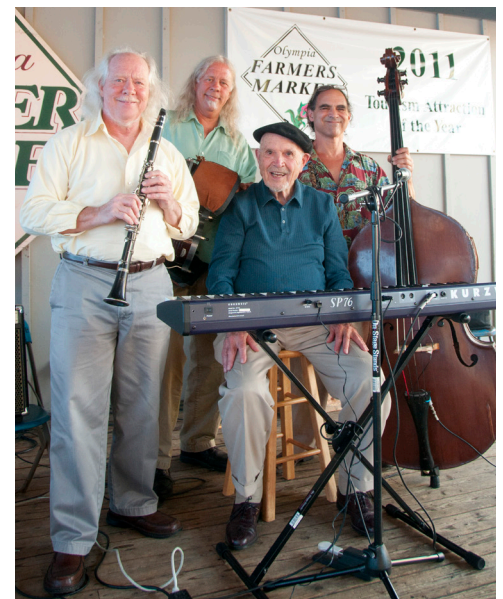
Support the music